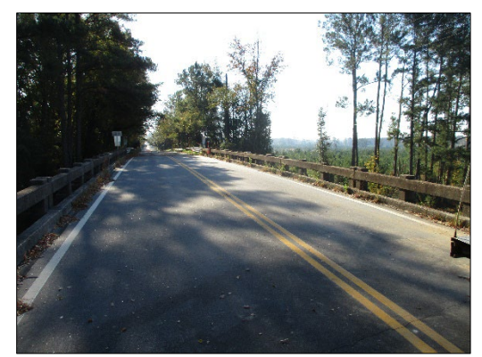
Photo 1 – US 21 (Frampton Rd.) Bridge over CSX Railroad, Hampton and Beaufort Counties, SC.

The existing Bridge (~123.9'L x 26.0'W, inside curb to inside curb), is located on US 21 (Frampton Rd.) and crosses over CSX Railroad in Hampton and Beaufort Counties, South Carolina. The date of construction of the Bridge is unknown. The structure is a two (2) lane, three (3) span Bridge with concrete decking, and curbing and gutters, with an asphalt overlay. The concrete decking is constructed with pour-in-place (PIP) concrete, supported by six (6) horizontal steel girders. There are six (6) structural steel girders per span that are supported by PIP bent caps with two (2) steel bearing