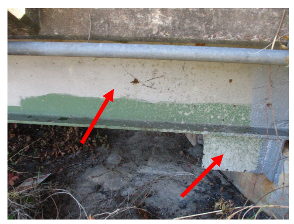
Photo 5. LBP on Gray Steel Girders and Green Steel Girder Brackets.